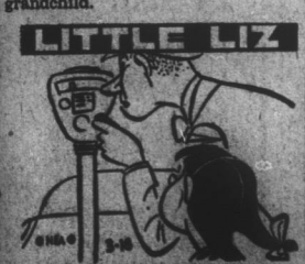
LITTLE LIZ The fellow who solves his parking finds that the parking meters and sales tax take care of them.