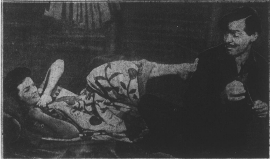
WOMEN LIKE 'EM TALL — THEY LOVE GABLE — Clark Gable is shown here in a scene from his latest movie, "The Tall Men," a rollicking Western with Jane Russell. The picture will be released this fall.