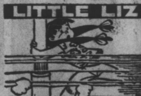
Some cars have fluid drive. Others just have a drip at the wheel.