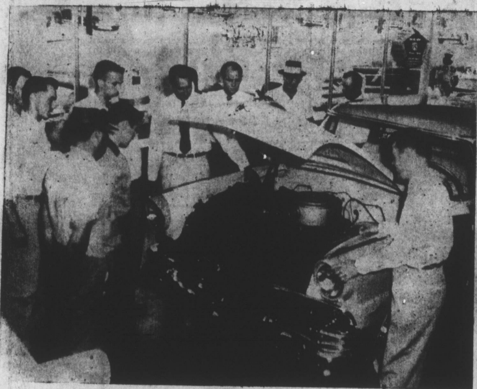
NEW FORD IN TOWN - It was in Dunn, blue and beautiful, today. The new Ford, whose 262 horsepower Thunderbird engine was drawing onlookers and prospective buyers from off the streets for their first look, appeared slick and streamlined but still had its own highly individualized styling. It is on display at Auto Sales and Service in Dunn. That's a companion model, the Ford station wagon.