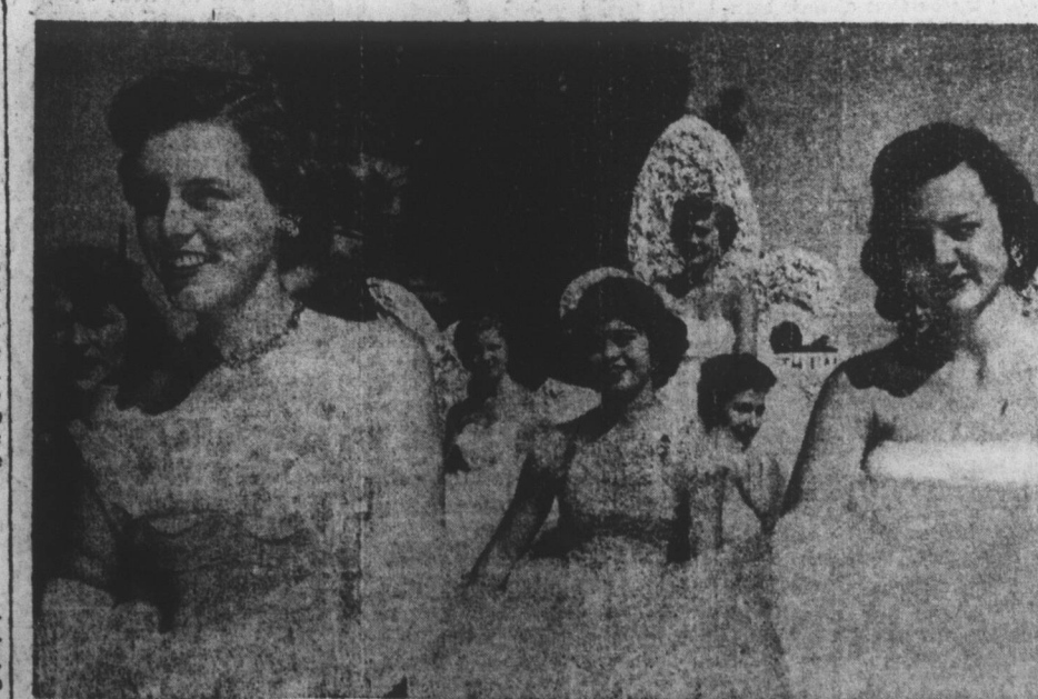
PRETTY GIRLS IN LILLINGTON PARADE — Pictured here are some of the pretty girls on Centennial parade yesterday. And there's nothing that decorates a float like pretty girls.