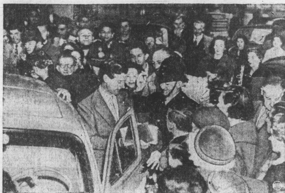
POLICE PROTECTION FOR PETER—RAF Group Capt. Peter Townsend is protected by London police as a crowd crushes around him as he attempts to enter his car after leaving his apartment in Lowndes Square. Popular in his own right as the pilot who shot down the first enemy plane in the Battle of Britain, the 40-year-old divorced father of two children has become the center of speculation after two visits with Princess Margaret.