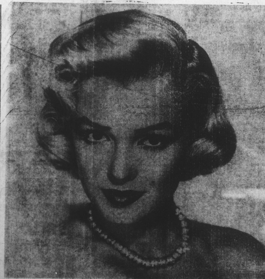
MARILYN MONROE—SWEET AND DEMURE

I heard the silken sultriness of that voice as the door opened. . . then Marilyn bounced in as only she can bounce, plopped down beside me . . . and I copped a peak at (Continued on Page Two)