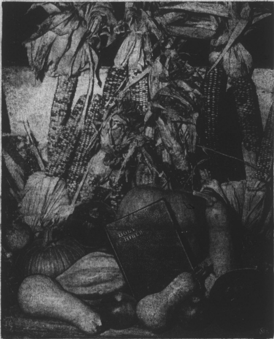
Thou crownest the year with thy goodness; and thy paths drop fatness. They drop upon the pastures of the wilderness; and the little hills rejoice on every side. The pastures are clothed with flocks; the valleys also are covered over with corn; they shout for joy, they also sing.