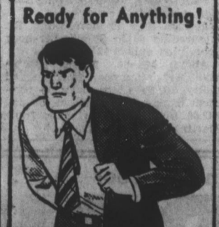
Ready for Anything!