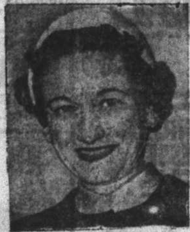
DUTCHESS OF WINDSOR

New York—I'm sorry about this—but a million and a half bucks is about all the Dutchess of Windsor can hope to get out of her life story.