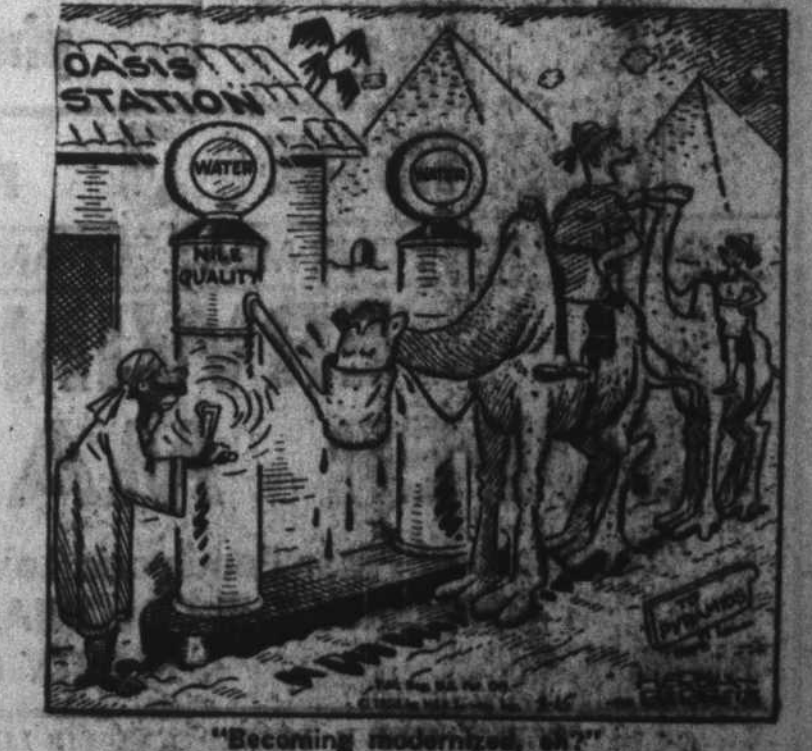
"Recording modernized, 21"