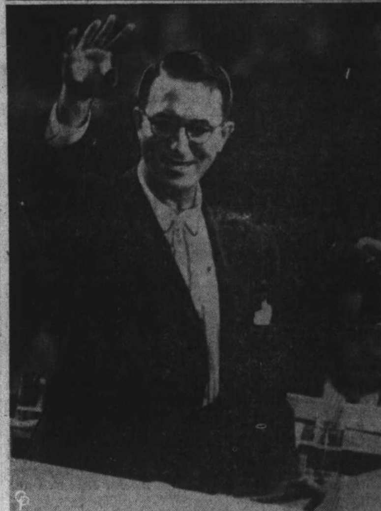
SENATOR ESTES KEFAUVER