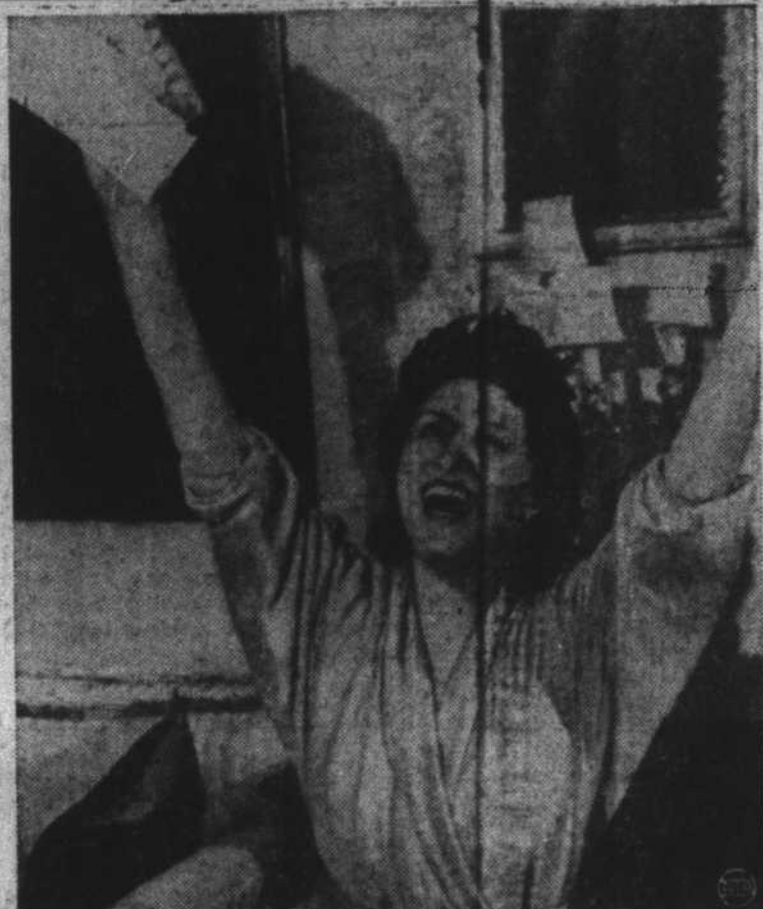
HALLELUJAH!—Actress Anna Magnani throws up her arms in jubilation when she learns in Rome, Italy, that she was named the best actress of the year. The Italian star was honored for her work in "The Rose Tattoo" at the annual Academy Awards presentations in Hollywood. Roused from sleep to be given the news, she shouted: "It's great... I feel just as if I'd built the Colosseum—it's all an earthquake inside."

The accident occurred two miles west of Benson at the intersection of Fairgrounds road and the Coats-Benson Highway.