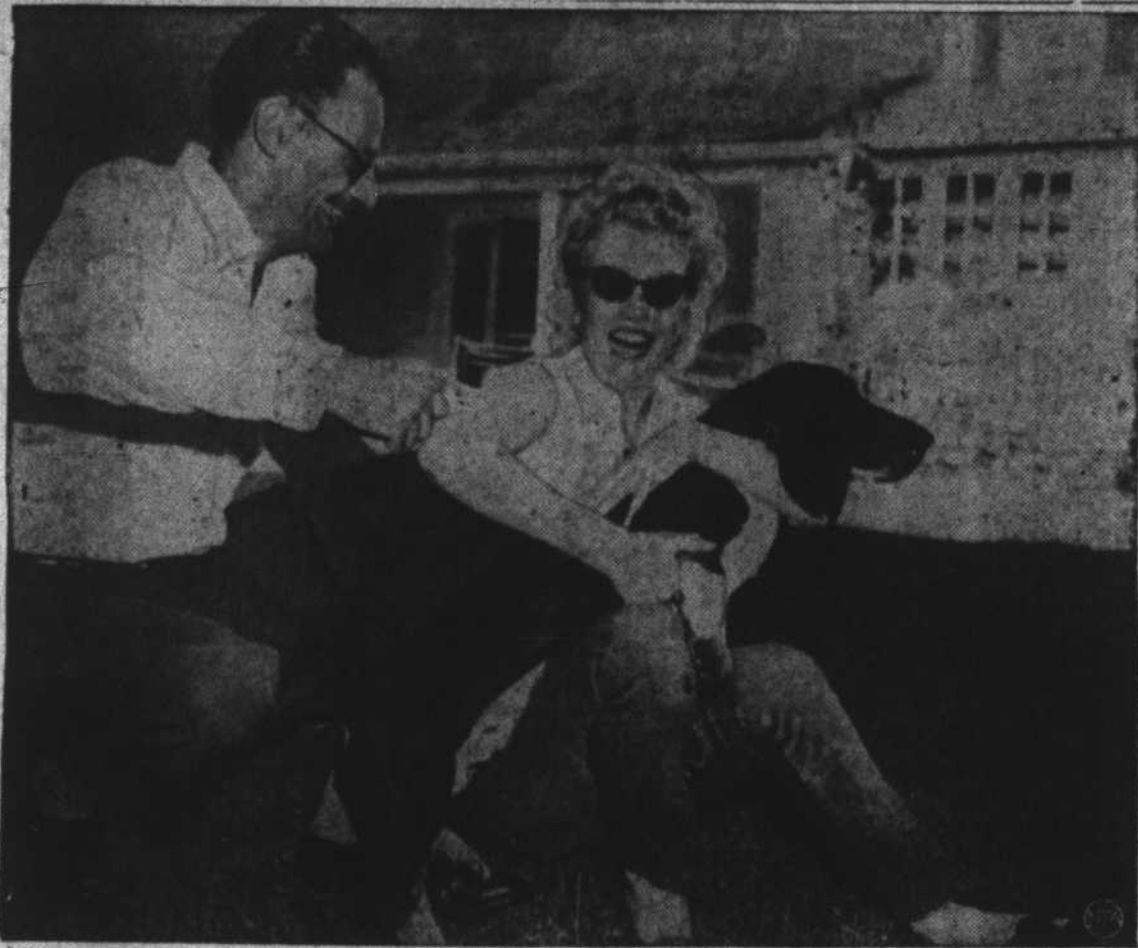
LOVE ME, LOVE MY DOG—And Marilyn Monroe, who's won Arthur Miller's heart, appears to have captured the complete affection of his pooch, Hugo. Their wedding? Well, it'll be held soon. Meanwhile, Marilyn is "resting" at the playwright's nine-room farmhouse, Roxbury, Conn.