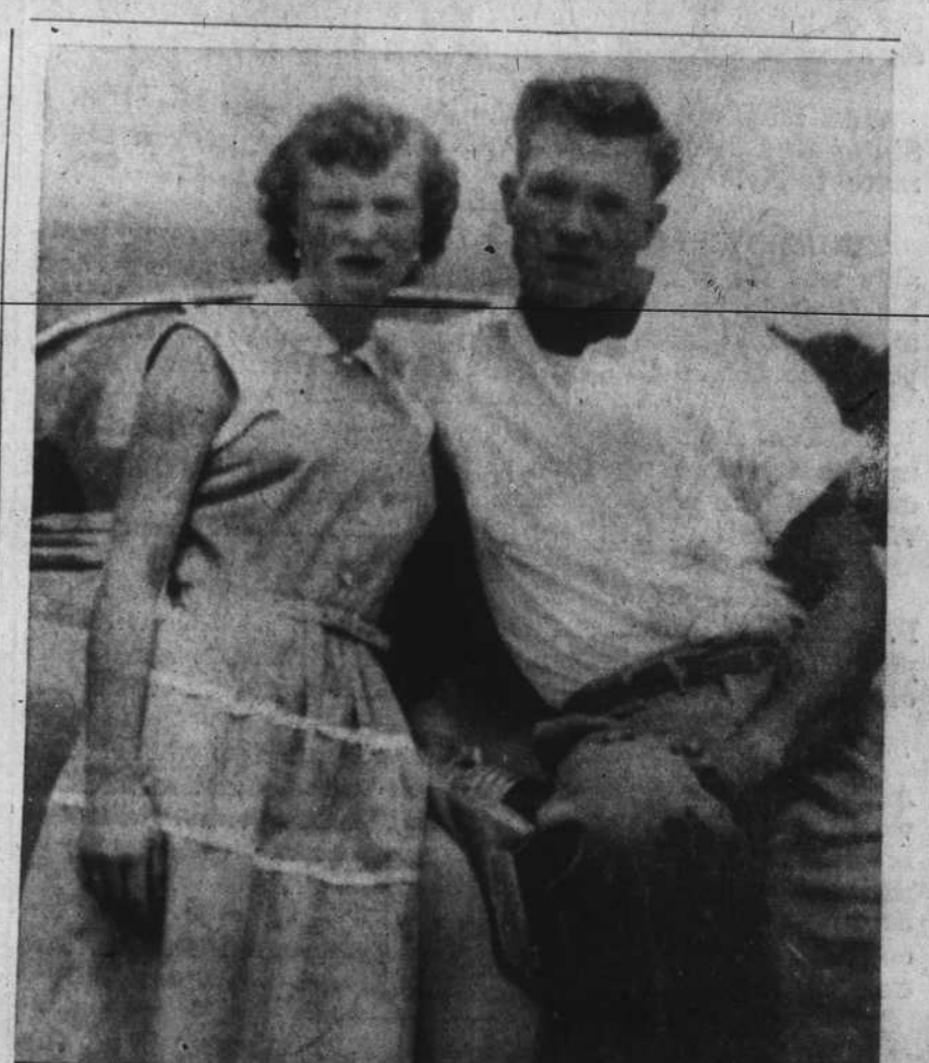
JACKSON SHOWN WITH WIFE

Lawyer Taylor said that under the law a cemetery cannot be disturbed even if it is on the property of the disturber. Said Blalock: Continued on Page Six