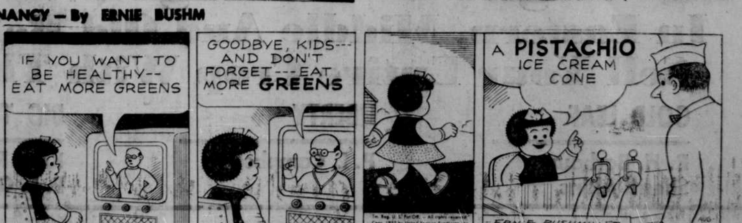
NANCY - By ERNIE BUSHM