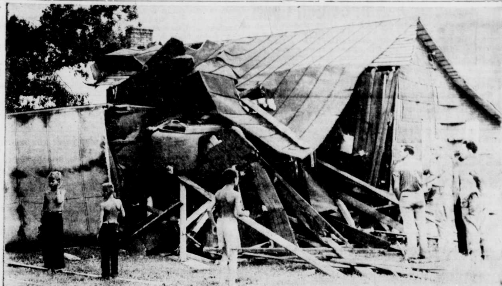
THE TRUCK THAT CAME TO DINNER