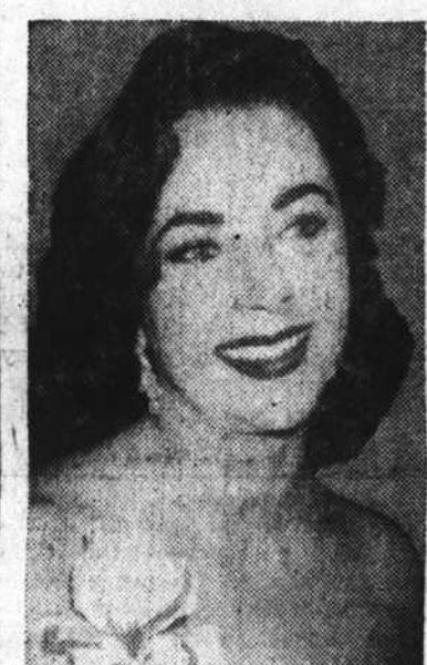
LIZ... Maggie the Cat Can Scratch...

HOLLYWOOD (UPI) — Actress Debbie Reynolds won a divorce from boyish singer Eddie Fisher today after testifying, "My husband has become interested in another woman." In obvious reference to sultry screen siren Elizabeth Taylor, the actress told the court, "It began early in September but there was great publicity and there were pictures in the papers. It still continues." Miss Taylor's name was not mentioned during the brief trial. Asked if she had discussed divorce at the time with the constipated singer, Miss Reynolds said: "Yes, we did discuss divorce and he said she wished to have one. To say the least, I was very distressed." The actress looked pert and cheerful and she walked into the (Continued On Page Two)