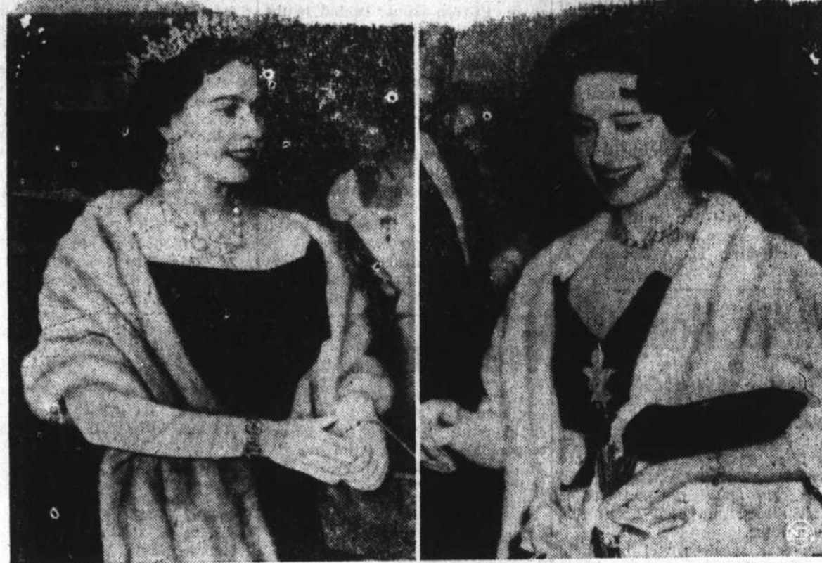
WHOSE IDEA WAS IT? —Spotting her fashion double supposedly throws milady into a decline, cured only by a new and different ensemble. These sisters, however, aren't chagrined at the similarity in their dress. Queen Elizabeth and Princess Margaret, right, arrive at a charity film performance in London, each wearing a black velvet dress and fur stole.

morning, March 11 at 10 o'clock in the Dunn city hall and a large attendance from the two counties is expected.