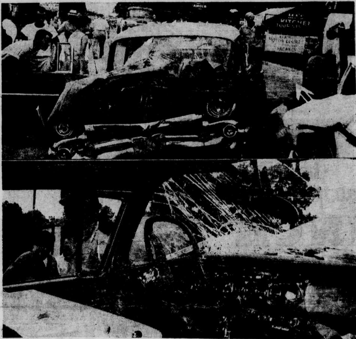
A CRAZILY BENT steering wheel and fiercely smashed front end give an indication of the terrific impact that sent seven persons to the hospital Sunday afternoon—two of them in critical condition and others with broken arms and legs.