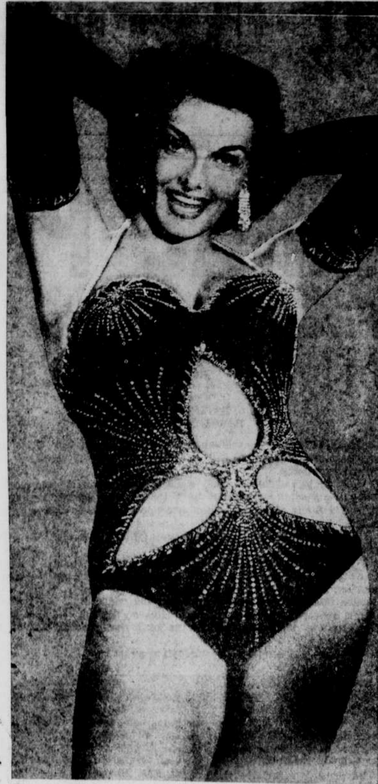
MAY QUIT FILMS — Jane Russell, a stranger to moviegoers since her "Fuzzy Pink Nightgown" disaster two years ago, will appear on the Ed Sullivan Show Sunday but may never be seen on a movie screen again. "For years I started an old picture they shoved at me," the bosomy beauty explained. "Almost all of them were terrible. Unless something really special comes along I won't consider motion pictures. I've had it."