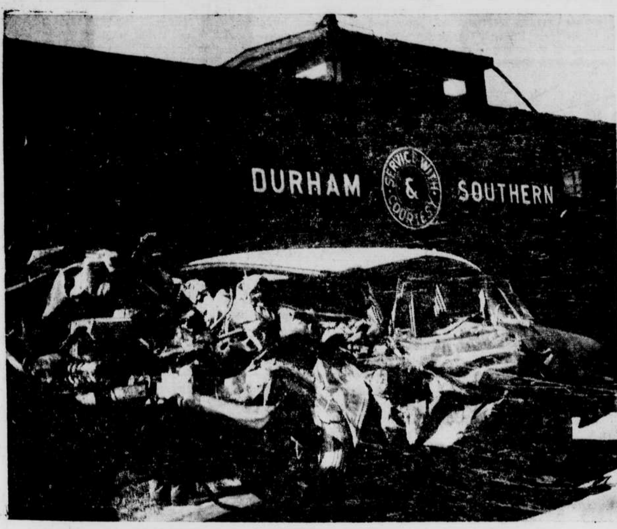
RAILROAD MOTTO "Service With Courtesy" troldman blamed the driver with failure to yield right of way.