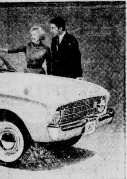
...represents a "breakthrough" in the future of the automobile industry. ...et shorter and three-quarters of ...aloon is a six-passenger car, with ... models.