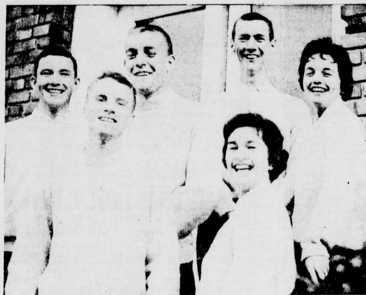
THEY ROCK—BUT GENTLY —With the educational director of a church to help them, the "Crewnecks" (named for their sweaters) are trying to wed the smoothie music of not so long ago with a king of gentled-up rock and roll beat.