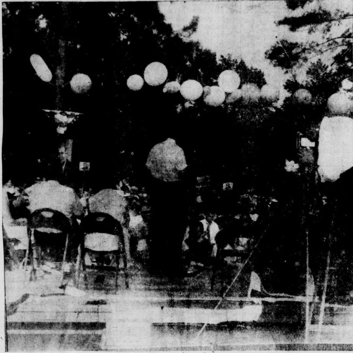
TERRY SANFORD ADDRESSES HARNETT RALLY

Whether new homes here should be required to include special mechanical garbage grinders is still being debated in the city council. The proposed measure, along with a condemnation ordinance, was slated for a vote last Thursday night but councilmen continued the actual vote until later. Action on the garbage disposals has been pending for some months now. Theory of its proponents is that city garbage collectors won't have to handle so much "wet garbage." The disposals would be required, at least at first, only in new construction. Councilman B. A. Bracey was absent at the latest meeting of the board. The condemnation ordinance was put back for discussion when all board members will be present. The city has invited comment from townspeople on this ordinance, the text of which can be examined at city hall. Mayor George Franklin Blalock told the commissioners Thursday night that there has been no further word from the county about joint city-county planning since a joint session many weeks ago. Board member Bill Bryan proposed that the city check its policy on requiring a $200 fee for sending the fire department to an out-of-town fire. His proposal was pre-empted by the burning of a car belonging to high school coach Guy Wilson, a Dunn resident who happened to be outside town when his car caught fire and burned. City attorney Howard Godwin will determine whether the car, as personal property of an actual resident, would be subject to the same fee as other rural fires.