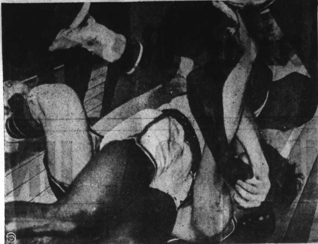
WARRIOR ON THE WARPATH — Al Attles (top) of the San Francisco Warriors battles Bob Ferry of the Detroit Pistons at Madison Square Garden in New York. Attles was ejected from the game after he started the free-for-all, Detroit won, 111-102.