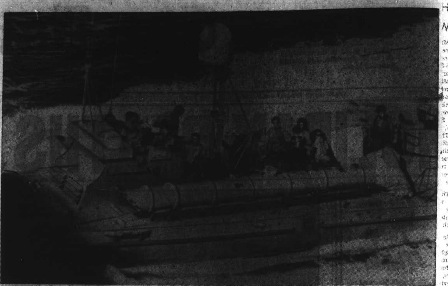
CASTRO'S NAVY AT WORK —Photograph taken from a Coast Guard patrol plane shows a Cuban PT boat leaving Anguilla Key carrying some of the 19 Cuban refugees forcibly removed from the British possession in the Bahamas. Intelligence experts claim that Castro, besides using regular navy boats such as this, is building a "fishing fleet" of 200 vessels. Under the guise of peaceful fishing operations, these boats would cut exile escape routes and also approach close to South and Central American coasts to carry on subversive activities. On the other hand, anti-Castro commandos are using armed motorboats to harass Cuban coastal military and industrial installations. In one recent attack, motorboats were lowered over the side of a mother ship to carry out attacks in river estuaries.