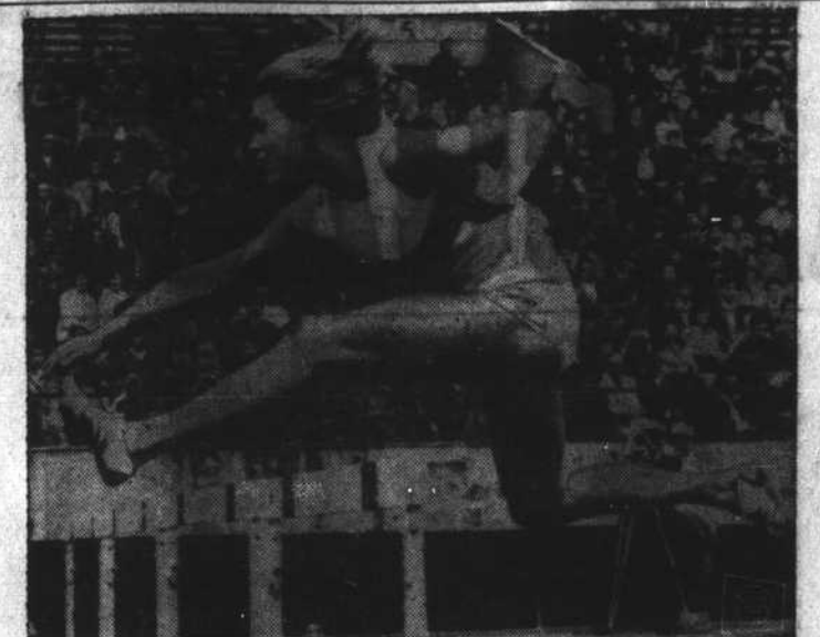
OLYMPIC WARM-UP—Germany's Jutta Heine does the 80-meter hurdles in 11.1 seconds, as the Tokyo Pre-Olympic International Sports Meet opens.