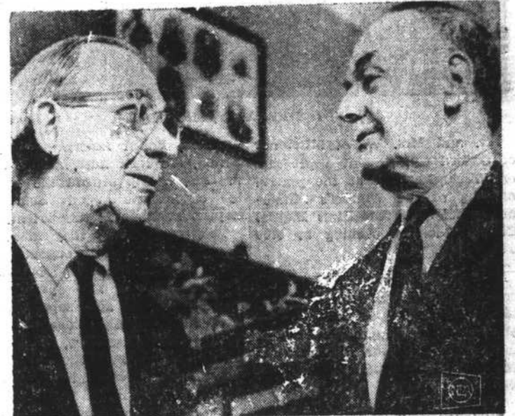
BAKER INQUIRY OPENS—Senate Rules Committee Chairman B. Everett Jordan, D-N.C., left, speaks with Sen. John J. Williams, R-Del., first to testify at hearings concerning former Senate Democratic Secretary Robert G. Baker open in Washington.

TOKYO (UPI) — Gen. Paul D. Harkins, top U. S. military commander in South Viet Nam, said Thursday the right against the Communist Viet Cong is going so well that some U. S. troops there will be sent home within 60 days.