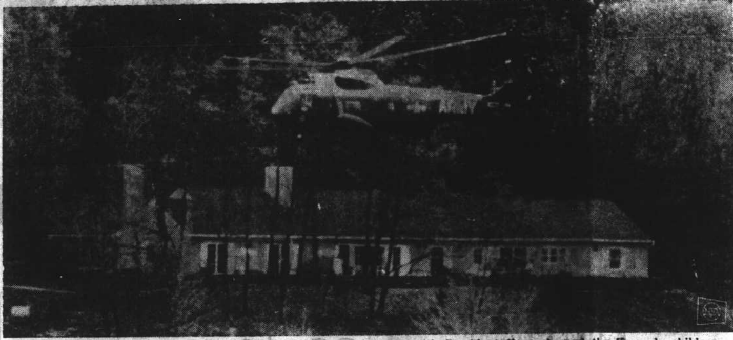
JUST A COPTER HOP FROM WASHINGTON—Army helicopter with President Kennedy and the Kennedy children aboard takes off after the Kennedys' first weekend in their new Rattlesnake Mountain home near Atoka, Va.