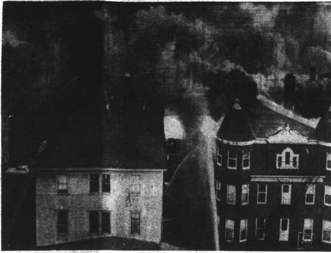
FIRE RAVAGES RESORT CITY —Firemen wage heroic battle from the street and rooftops to contain a roaring fire in Atlantic City, N.J. The toll included more than 30 lives.