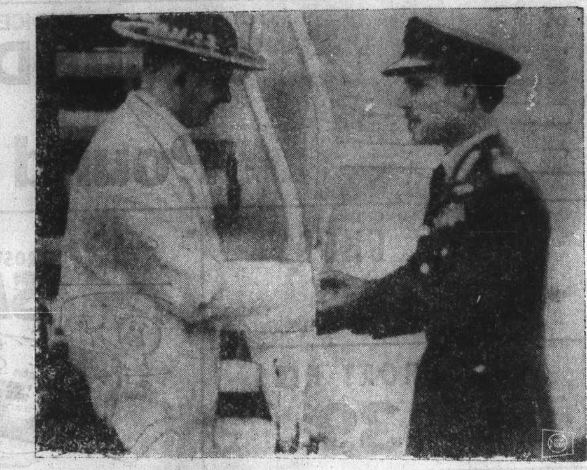
PILGRIMAGE OF PRAYER — Pope Paul VI is greeted by King Hussein of Jordan on arrival in Amman. The Pope trod the places Jesus Christ walked 2,000 years ago. He returned to Rome today.