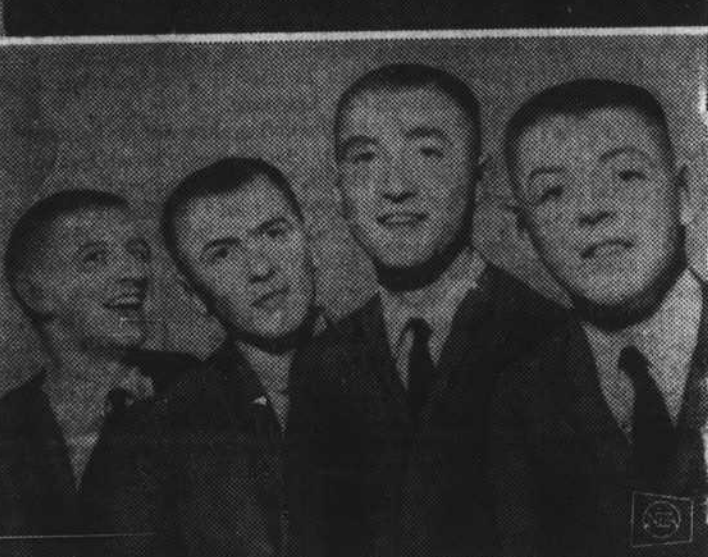
UNDER THE BRUSH-Picture at bottom, retouched by artist, shows how the Beatles would look if they had colle-giate quartette short haircuts.