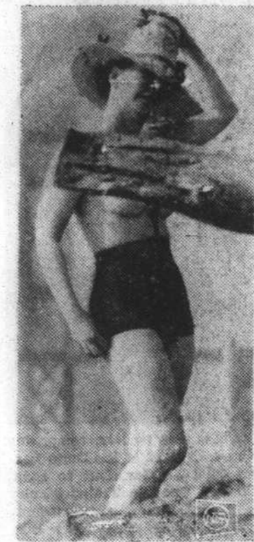
THAT (!) SWIMSUIT — With the aid of a discreetly located piece of driftwood, a San Francisco model shows off the "nude" swimsuit which has caused a furor in the fashion world. The suit is made up of wool knit trunks and two thin straps.