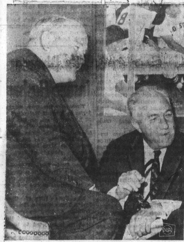
STILL SMILING —It's obvious that American League president Joe Cronin, left, and Baseball Commissioner Ford Frick, right, are not discussing the American League's troubles.