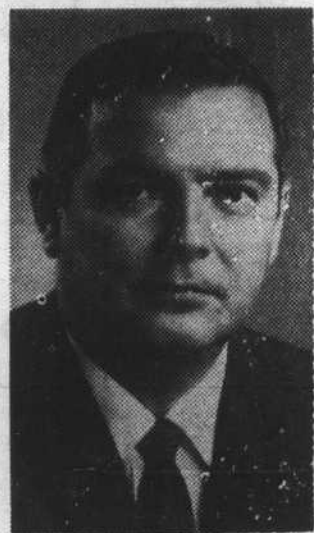
W. M. HARRIS

This means that the reins of the party organization will be firmly in Goldwater's hands. Goldwater has made it clear in statements here that he wants to revitalize the national committee setup and return it to a position of power in the dispensing of federal patronage.