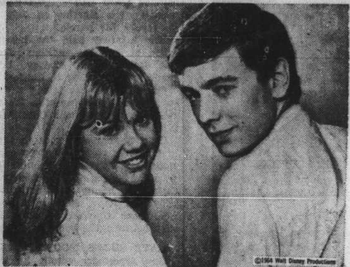
CO-STARS Hayley Mills and Peter McEnery add youth, looks and talent to Walt Disney's first suspense-mystery, "The Moon Spinners." Eli Wallach and Pola Negri also star in the Technicolor feature. Released by Buena Vista. Opens Wednesday at your Stewart Theatre.