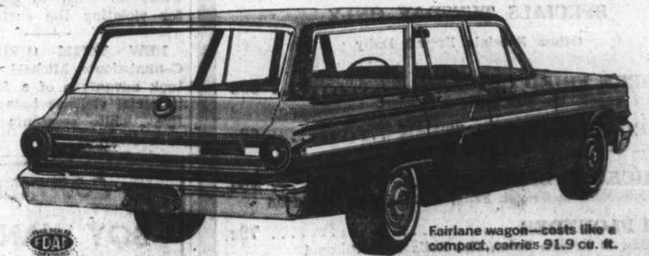
Fairlane wagon—costs like a compact, carries 91.9 cu. ft.