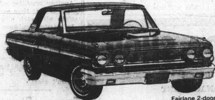
Fairlane 2-door hardtop—family-size car with sports-car feel.

The big swing to Ford has boosted Ford sales to a record high—and we're striking a new high note in trades to keep 'em that way! Hurry in and save!