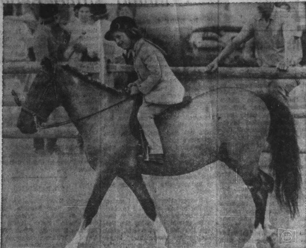
MACARONI AND SPICE —Macaroni and Caroline Kennedy ("Sugar 'n' spice, etc.") make a pretty picture at a horse show in Hyannis, Mass. The late President's daughter and her pony had just placed sixth in a 4-H horse show.