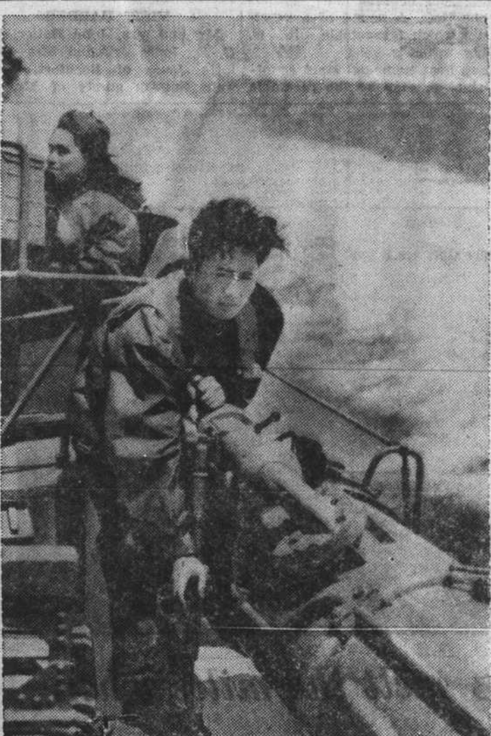
PT boats are used by the Red Chinese navy to prowl the thousands of miles of coastline around China. This young sailor is manning a torpedo gun.

W. & S. MOTOR CO., INC. 203 N. WILSON AVE. DUNN, N. C.