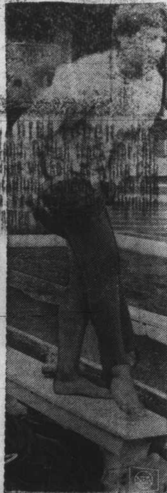
LADIES TOUCH—Mary Sand, British track star, finishes workout at White City Stadium, London, where she is training for Olympic games at Tokyo.