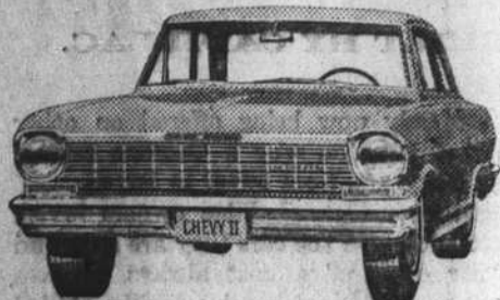
Chevrolet Nova 2-Door Sedan