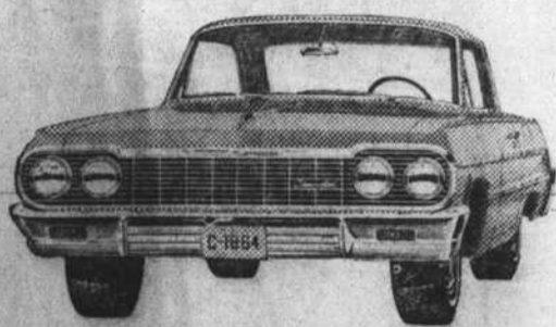
Chevrolet Impala Sport Coupe

If you're the kind of buyer who looks out for No. 1 (that's you) look for the man with the No. 1 deals—now! (that's your Chevrolet dealer)