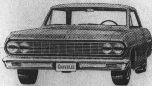
Chevrolet Malibu Sport Coupe