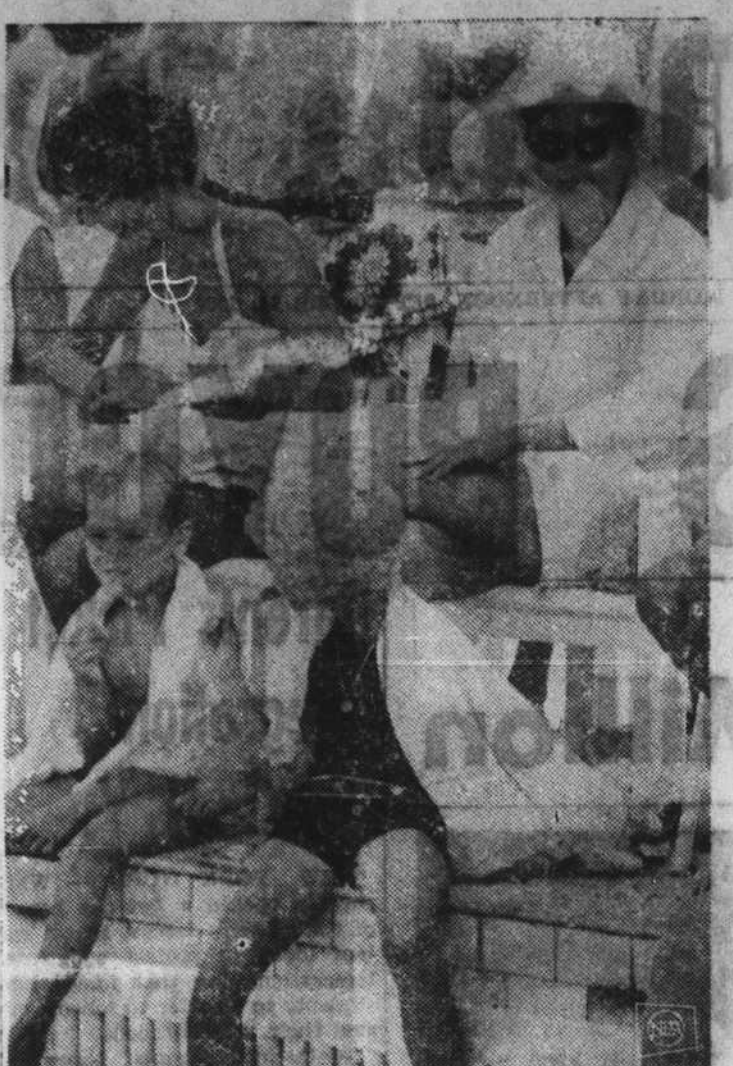
PROUD MOM—Monaco's Princess Grace, right, the former Grace Kelly, sits proudly with her two children, Prince Albert, left, and Princess Caroline at Monte Carlo beach. The 38-year-old Princess is expecting her third child in February. Woman beside Princess Grace was not identified.