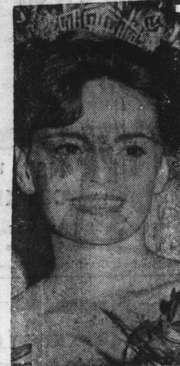
HER HIGHNESS — Vonda Kay Van Dyke has taken up her year's reign as Miss America with a press conference in New York.

The FDA has considered in the past that moderate use of artificial sweeteners and artificial sweetened foods generally was safe.