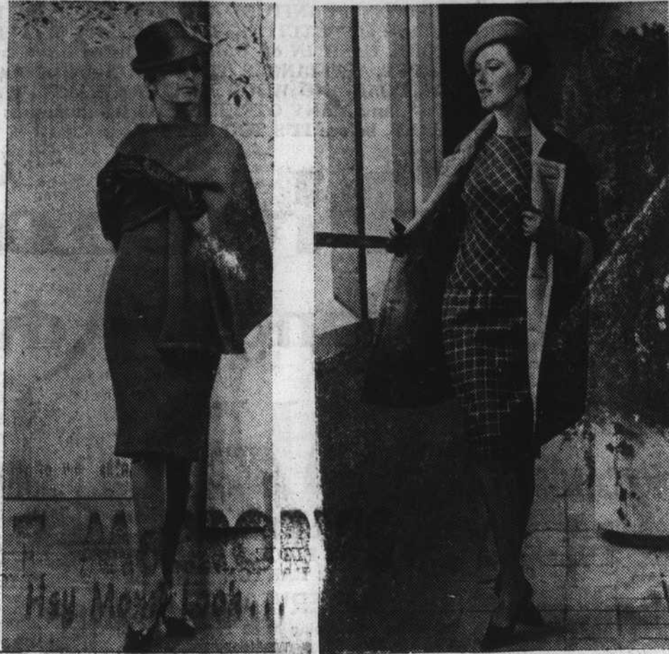
Slim, elegant lines will play an important role in fashion for fall. The closer fit is seen in the walking dress (left) done by Geoffrey Beane in cherry red, soft textured wool tweed from England. Only detail in this costume is weltting on the yoke which continues down the back. The dress is demarcated by a huge self stole. Teal Trains' reversible for, and camel coat of lightweight British wool (right) is worn with a two-piece elongated check worsted dress.