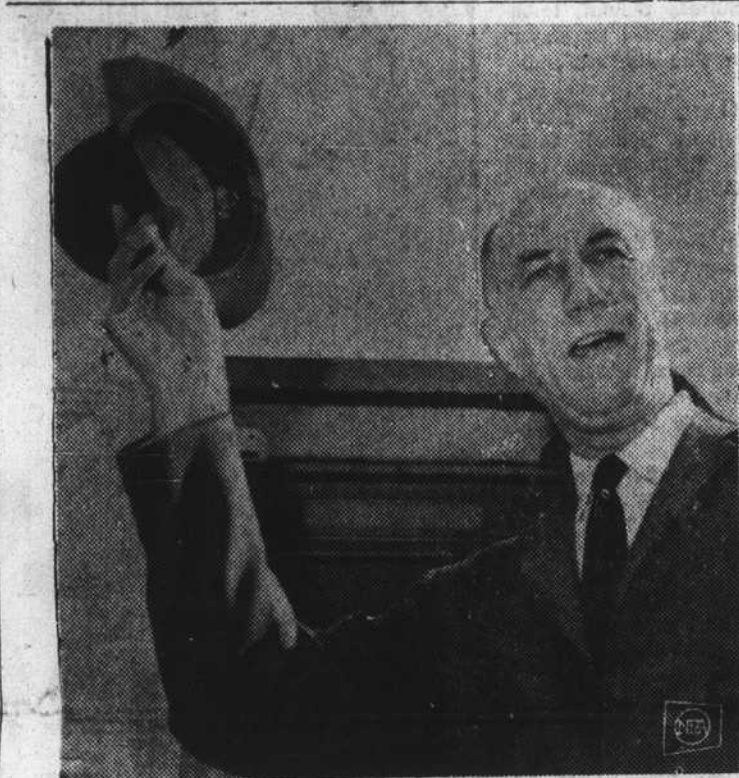
GOLDWATER BOOSTER - Sen. Strom Thurmond as he accompanied Senator Barry Goldwater on his campaign tour in S. C. and Louisiana yesterday.