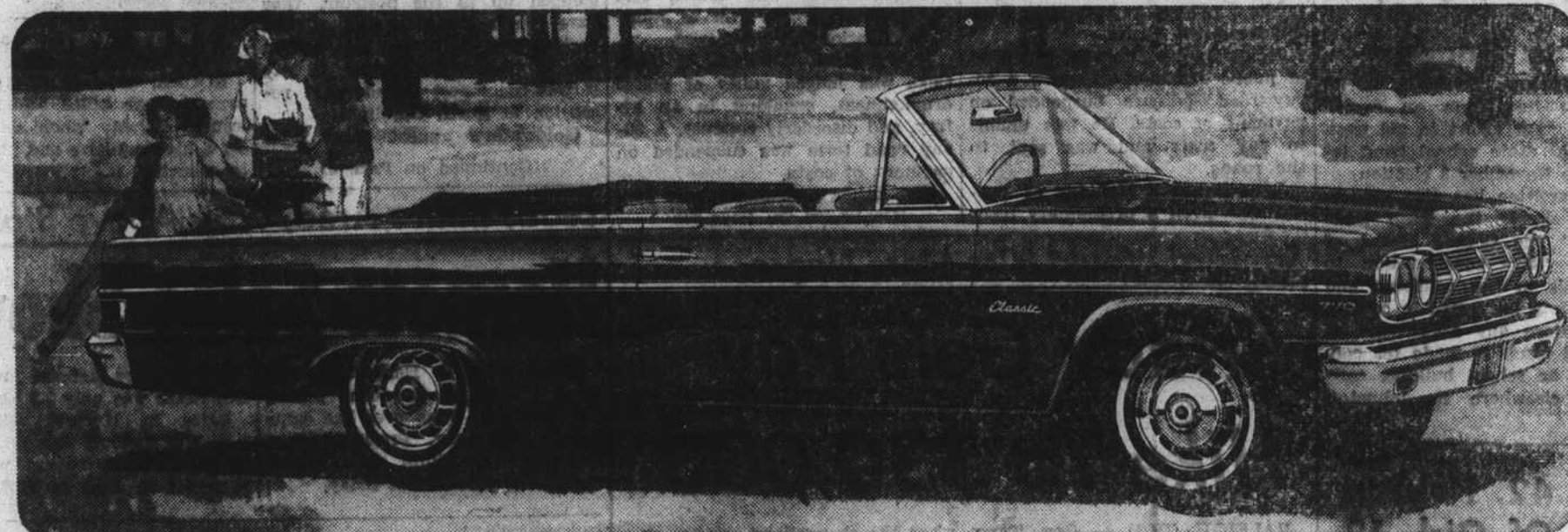
'65 RAMBLER CLASSIC New Intermediate-Size Rambler

SPECTACULAR! Totally new in size, in style, in power. New longer wheelbase. SENSIBLE! Greater room, easy handling. NEW! Disc Brakes, optional. NEW! Spectacular choice of engines from the all-new 155-hp Torque Command 232 Six to optional 327 cu-in. V-8. NEW! Twice as many Ambassador models for 1965, including a dazzling new convertible.