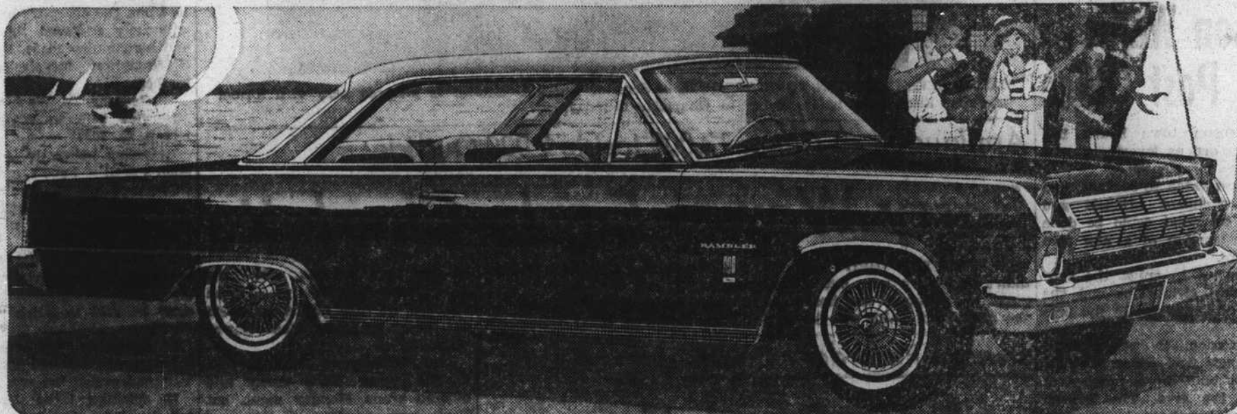
'65 RAMBLER AMBASSADOR Largest and Finest of the New Ramblers

SPECTACULAR! Totally new in size, in style, in power. New longer wheelbase. SENSIBLE! Greater room, easy handling. NEW! Disc Brakes, optional. NEW! Spectacular choice of engines from the all-new 155-hp Torque Command 232 Six to optional 327 cu-in. V-8. NEW! Twice as many Ambassador models for 1965, including a dazzling new convertible.