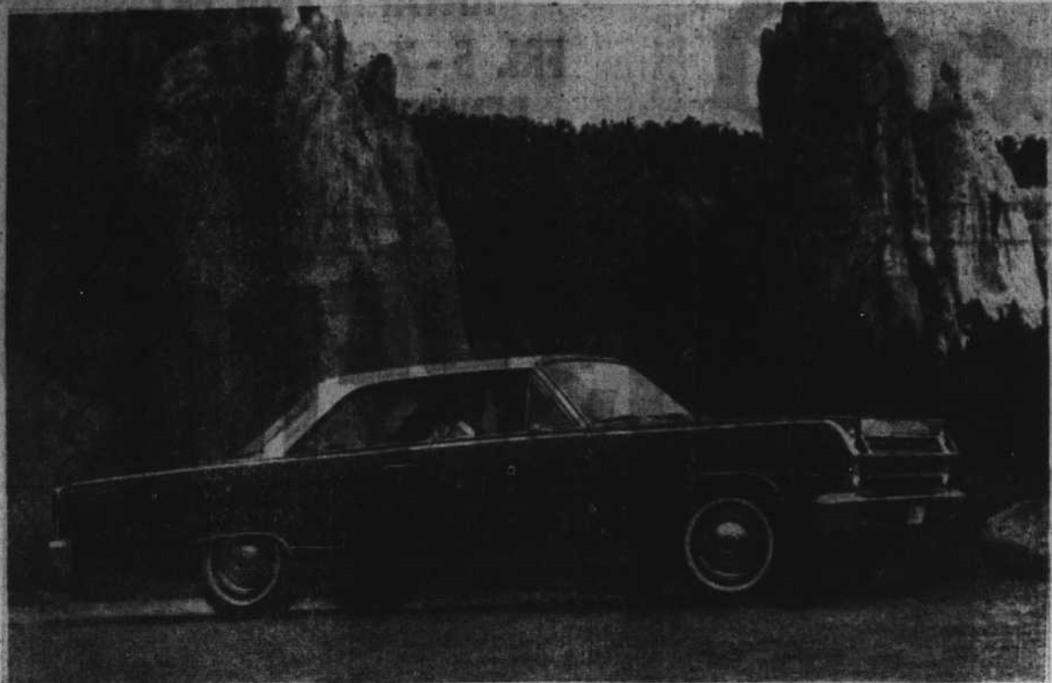
THE NEW RAMBLER — The luxurious Rambler Ambassador line has been completely restyled for 1965 and offers a full selection of models, including two and four-door sedans, hardtops, station wagons and a convertible for the first time. Shown is the Ambassador 990 two-door hardtop. The Ambassador offers a wide selection of engine choices, ranging from the 155-horsepower six-cylinder Torque Command to a 270-horsepower V-8. Front disc brakes also are offered for the first time as an option on both Ambassador and Classic models for 1965. It will be shown in Dunn at the Dennis Rambler Co.