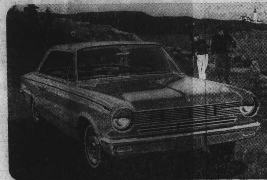
'65 RAMBLER AMERICAN The Compact Economy King

SPECTACULAR! Biggest, most powerful Classics ever—new convertible, sedans, hardtops, wagons. SENSIBLE! Increased space, outmaneuvers other U.S. makes. NEW! Three versions of new Torque Command Six. Two V-8 options, up to 270 hp. NEW! Disc Brakes, optional. Double-Safety Brakes, separate systems front and rear, standard on all Ramblers.