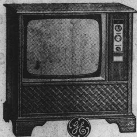
Model M 763 AMD

Premiere Showing Of 1965 Models G.E. Televisions Now Going On