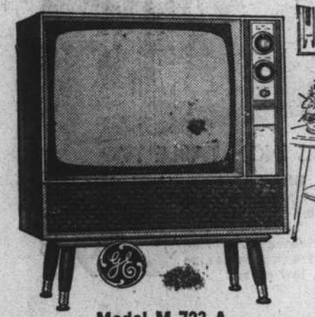
Model M 723 A