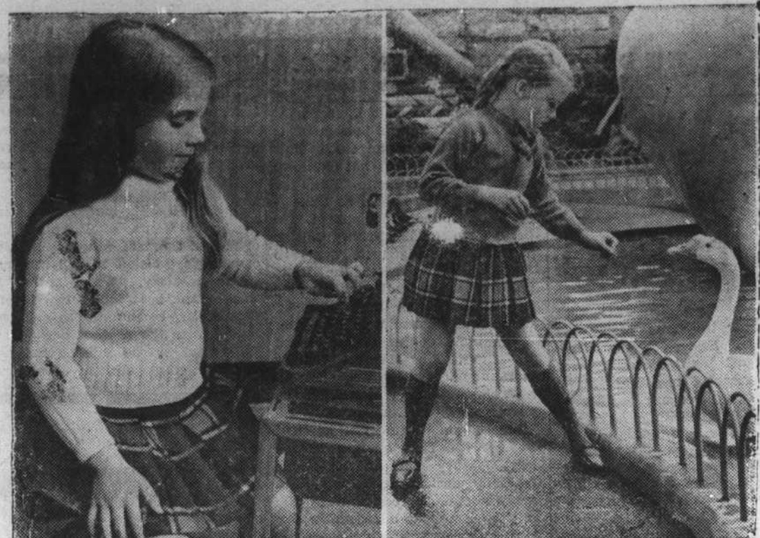
Every young miss wants to look her best for a day out with dad. Youngest addition to the office staff (left) is ready for any emergency in a bright plaid skirt and co-ordinated white turtleneck sweater. For a day at the zoo, this young animal lover (right) wears a zippered cardigan trimmed with tasseled pompons, a blocky plaid skirt and matching knee socks. Creslan adds its easy-care quality to these togs by Newport.