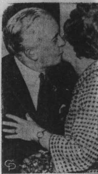
WINS A KISS—British Labour Party leader Harold Wilson kisses his wife in Huyton, England, as the vote count put the Conservative Party behind.