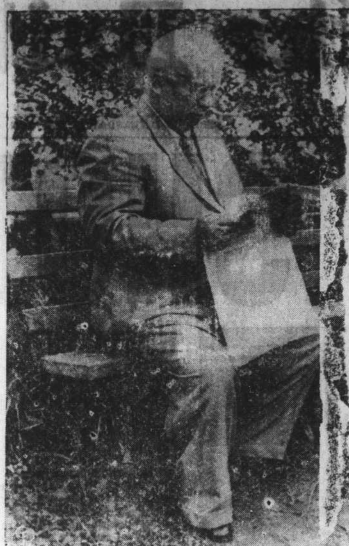
JOB HUNTING?—This photo of Nikita Khrushchev reading a newspaper on a park bench in Sverdlovsk, U.S.S.R., while he still was premier, could be a new photo of Mr. K reading the "Help Wanted" columns today.