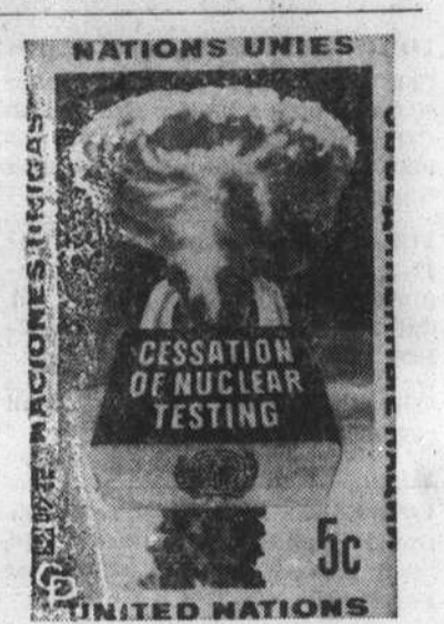
TEST BAN STAMP—The U.N. Postal Administration issues this stamp commemorating the signing of the nuclear test ban treaty.