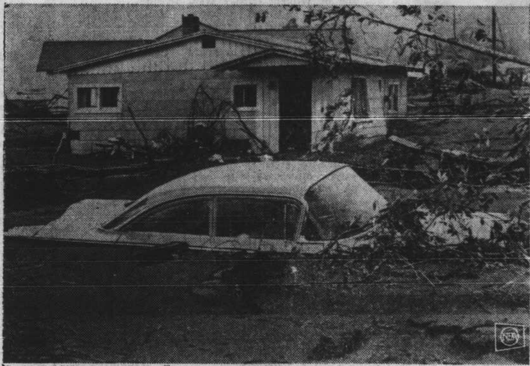
WILL IT START? — An auto lies buried in mud left behind by the Klamath River when it came out of its banks at Klamath, Calif.

"The time is about at hand when we are going to have to reevaluate our position to Viet Nam and decide whether there is any possibility of saving those who are a little bit indifferent to their own salvation," he said.