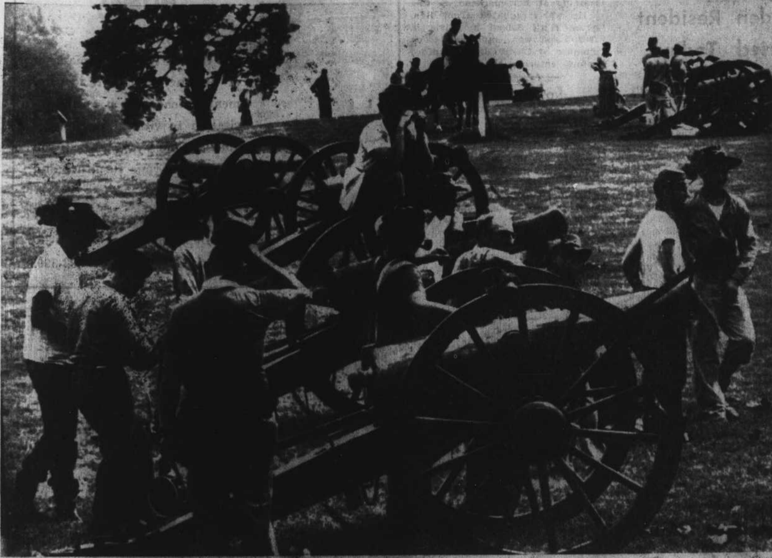
TROOPS, EQUIPMENT ARRIVING FOR BATTLE — Cannons such as this authentic Civil War period piece of artillery will be seen during the re-enactment of the Battle of Averasboro, tomorrow. This scene took place during the Battle of First Manassas during the summer of 1861 at an encampment that site. Participants, equipment and visitors were rolling into town today.