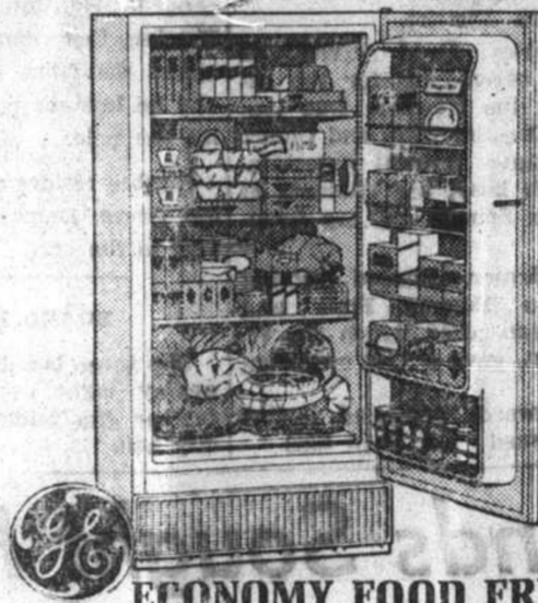
ECONOMY FOOD FREEZER Model CA-12SA • 11.6 Cu. Ft. Net Volume