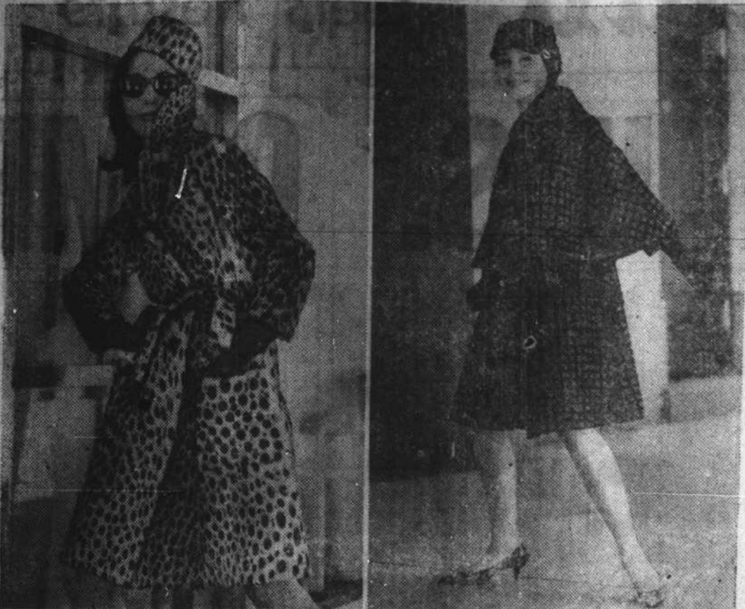
Sporty styles in handsome furs make their appearance for fall and winter. True trench coat with self-belt (left) is of cheetah and called "James Bond." Sherlock Holmes coat (right) is of stencilled lapin, red on black or green on black. Cape is removable and may be worn separately. These designs are by Donald Brooks for Coopchik-Forest.