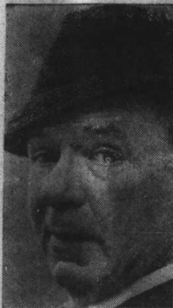
STAR RISES LATE—For Jack Albertson it was a life of vaudeville and burlesque until, at 54, fame came suddenly with his role in Broadway's "The Subject Was Roses." Albertson now is in Hollywood mulling over the many movie offers pouring in.