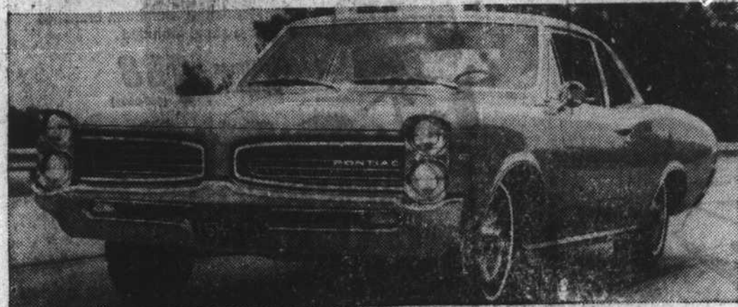
This is our economy tiger.

There are 38 more tigers in between—all Wide-Tracks, all Pontiacs/66.