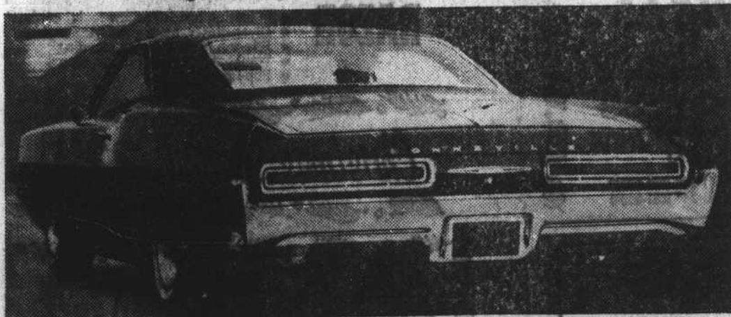
This is our luxury tiger.

What's new in tiger country? What did you have in mind?